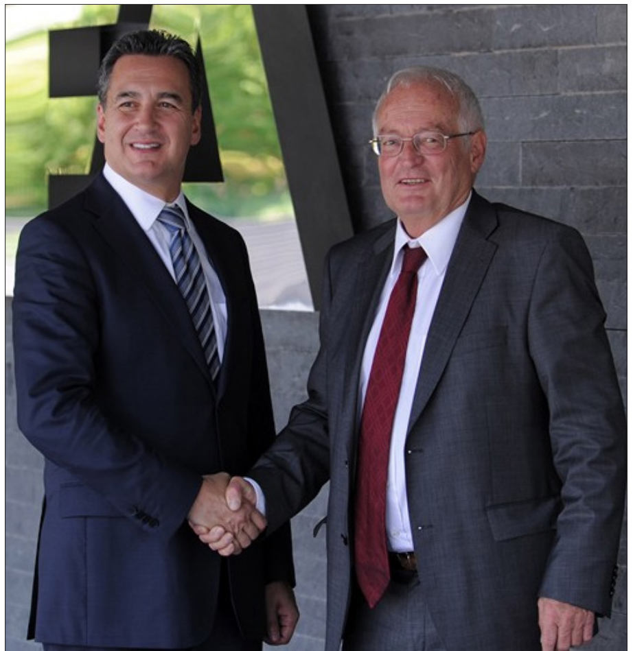
Galten als Top-Juristen, verwirren mit merkwürdigen Resultaten: FIFA-Ethiker Michael Garcia, Hans-Joachim Eckert nach ihrer Verpflichtung 2012 durch Joseph Blatter.

I explained that what I could talk about was how the budget shifted, and