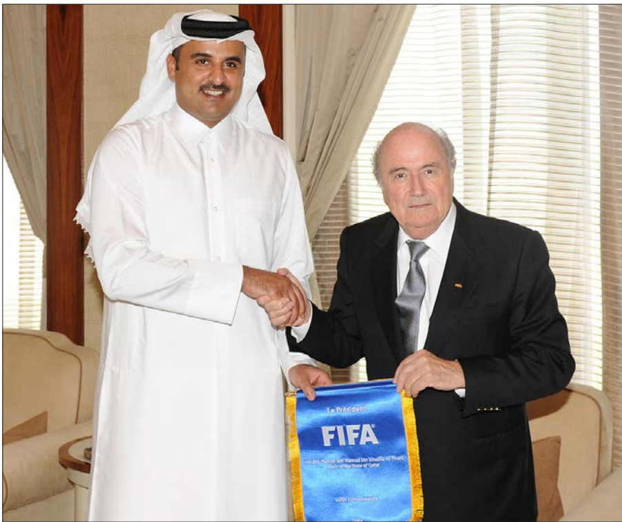
Joseph Blatter im November 2013 beim Jung-Emir Tamim.

„We just met with your former colleague,“ he said. „He said these two different budgets might be unusual but not improper.“