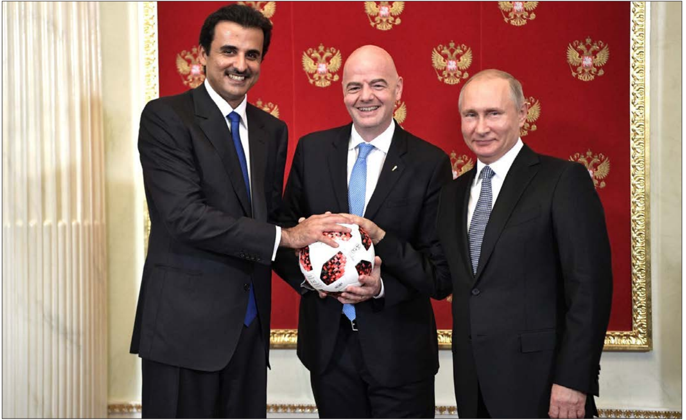
Selten so gelacht: Kataris Emir Tamim Bin-Hamad Al-Thani, WM-Gastgeber 2022, FIFA-Boss Gianni Infantino und Russlands Präsident Wladimir Putin, WM-Gastgeber 2018, bei der symbolischen Übergabe des WM-Balls im Juli 2018 in Moskau