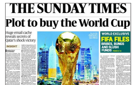
Sunday Times, Juni 2014.